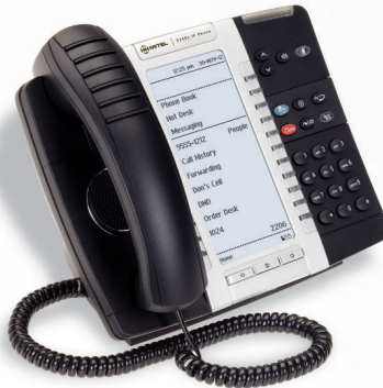
MiVOICE 5340e IP PHONE