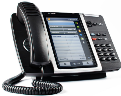
MiVOICE 5360 IP PHONE