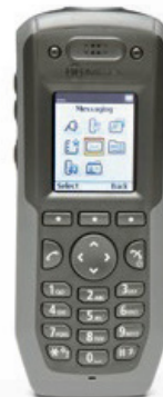
MiVOICE 5607 HANDSET