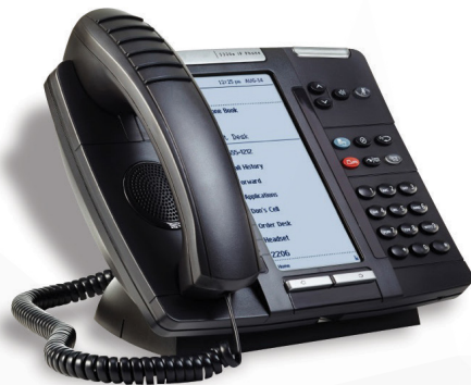
MiVOICE 5320e IP PHONE