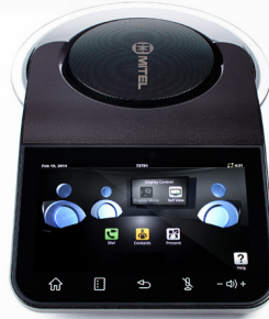
MiVOICE CONFERENCE PHONE