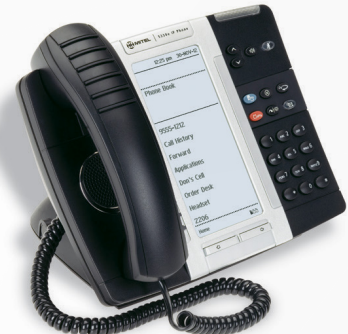
MiVOICE 5330e IP PHONE